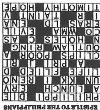
EPISTLE TO THE PHILIPPIANS