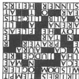
EPISTLE OF JAMES