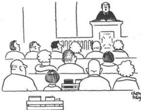
"... AND TO THOSE OF YOU WHO HAVE BEEN STAYING AT HOME TO WATCH TELEVANGELISTS, MAY I SAY, WELCOME BACK TO LIVE ACTION."