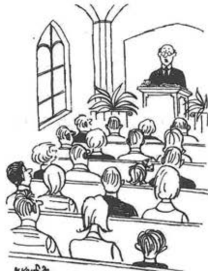
"INASMUCH AS OUR OFFERING TODAY WAS QUITE POOR — INSTEAD OF THE NEXT HYMN, WE'LL NOW SING THE BLUES."