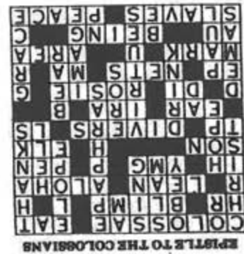
EPISTLE TO THE COLOSSIANS